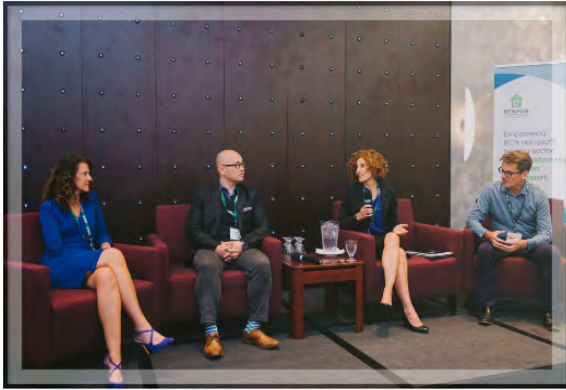
Participants at the 2018 RENT