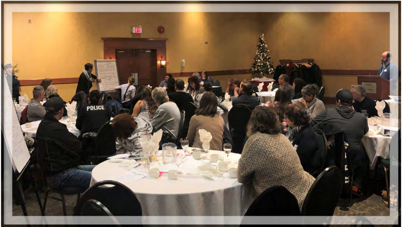
Workshop in Vernon, BC

In partnership with Urban Matters , HSABC is currently working on updating the City of Vernon's Homelessness and Attainable Housing Strategy . In December we hosted a workshop where we presented the preliminary strategy to over 70 participants. The goal of the workshop was to find out if anything was missing, discuss whether it would work in Vernon and determine who can help make implement the strategy.