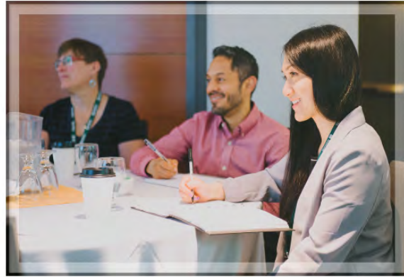
Participants at the 2018 RENT